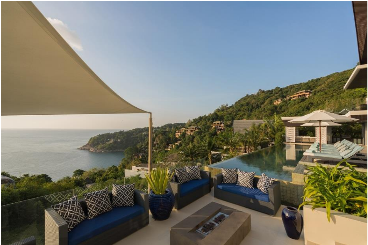
Experience a refreshing escape at Villa Saan's breezy outdoor.

In contrast, Phuket is always bustling. While party-goers seeking luxury prefer to stay around Kamala or Surin, at properties such as Amanzi Kamala and Villa Saan, both of which boast panoramic sea views, the well-traveled set often retreats to Cape Yamu, a classy neighborhood with gated, exclusive estates.