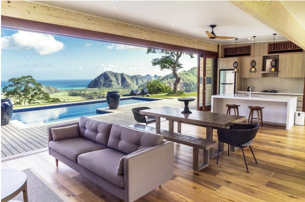
Take a break from city life and unwind at Selong Selo in Lombok.

Along the same lines, Selong Selo Resort & Residences offers a break from the city life. Tucked into the verdant hillside of southern Lombok, the estate's stunning villas have private pools and mesmerizing ocean views. Away from the hustle and bustle of crowded destinations, Lombok is an untouched land you will love to explore.