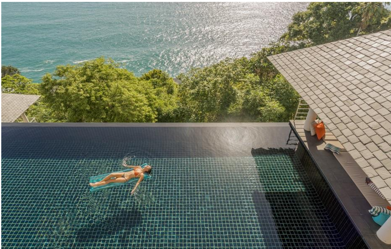
Relax and unwind at this exquisite oceanfront property in Phuket: Baan Paa Talee

Imagine relaxing on a sun lounger as you watch the palm leaves outline the sky, birds chirping in the distance with the sound of surf interrupting their chatter. The kids play nearby, supervised by able villa staff, their tinkling laughter bringing you joy as you sip your refreshing cocktail. You put on your sunglasses and revel in the warmth of this tranquil afternoon at this island paradise.