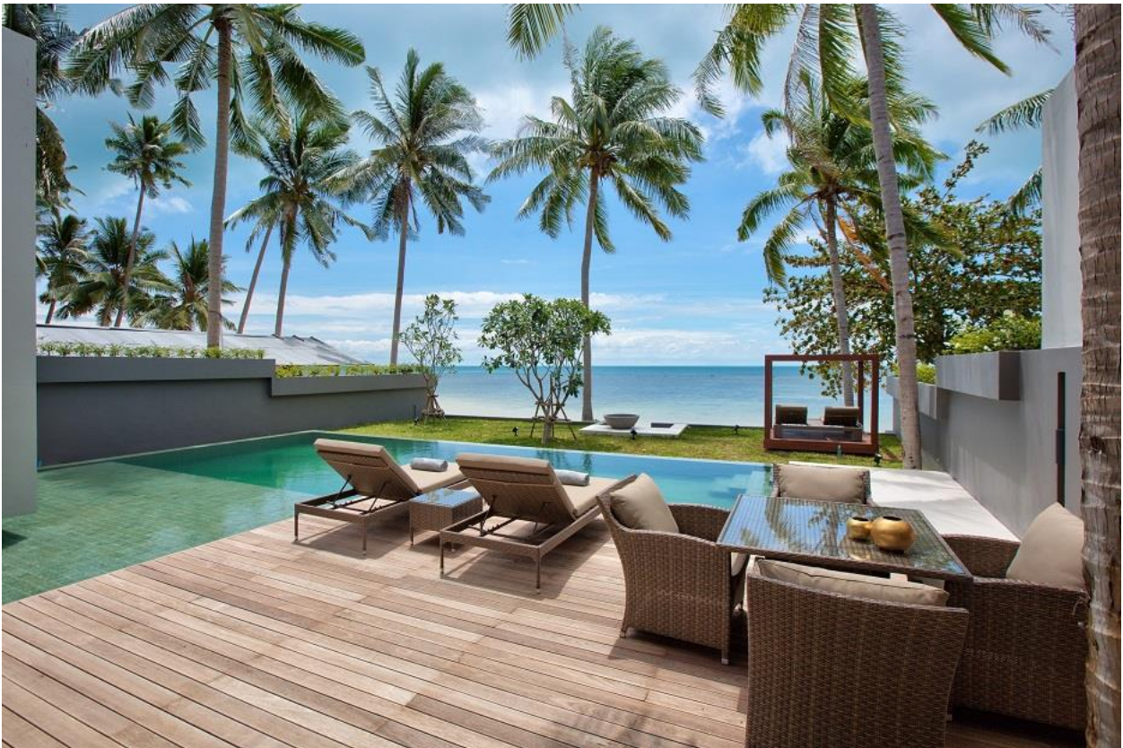
Villa Neung at Mandalay Beach Villas: truly a tropical sanctuary

If you've been there, done that, then there's no better place to spend the year-end holidays than Koh Samui. Pristine and quiet beaches, delicious food, and hospitable service staff in your villa make Samui an idyllic destination. The three-bedroom Villa Neung offers you the chance to step out of your villa, directly onto the soft sand, to enjoy the deserted beach for long romantic walks. And yes, the seclusion also allows you to get a Thai massage in an outdoor beachfront sala in your villa's garden.