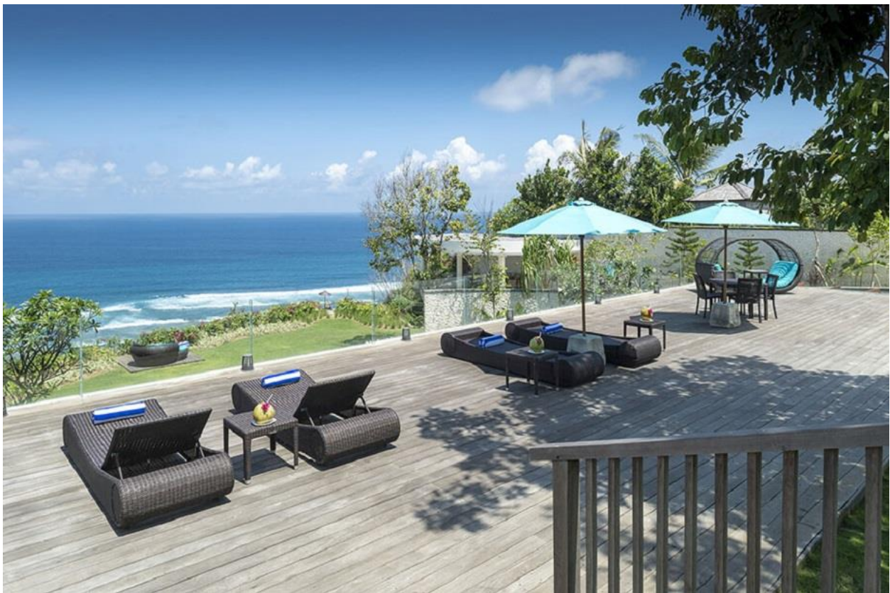
Enjoy Villa Markisa's magnificent setting in Bali's Pandawa Cliff Estate

Villa Markisa in Bali's exclusive Pandawa Cliff Estate boasts stunning ocean views from its enviable vantage point. A stylish home with five spacious bedrooms, with manicured lawns stretching out towards the endless ocean, offers a perfect getaway. A shared sports center with squash and tennis courts, a relaxing spa and a well-equipped gym keep guests busy while on holiday.