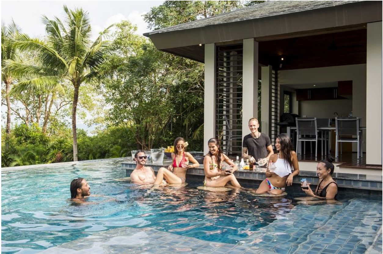
Have fun at Phuket Naam Sawan.

Whether on the white sand beach or with majestic sea views from atop rocky cliffs, the choices are aplenty at Elite Havens. Fulfill your Christmas fantasy and book a villa vacation before they are all sold out. With warm staff waiting for you, delicious feasts cooked by your in-villa chef and a multitude of activities to keep the entire group busy, we can't think of a better way to end the year.